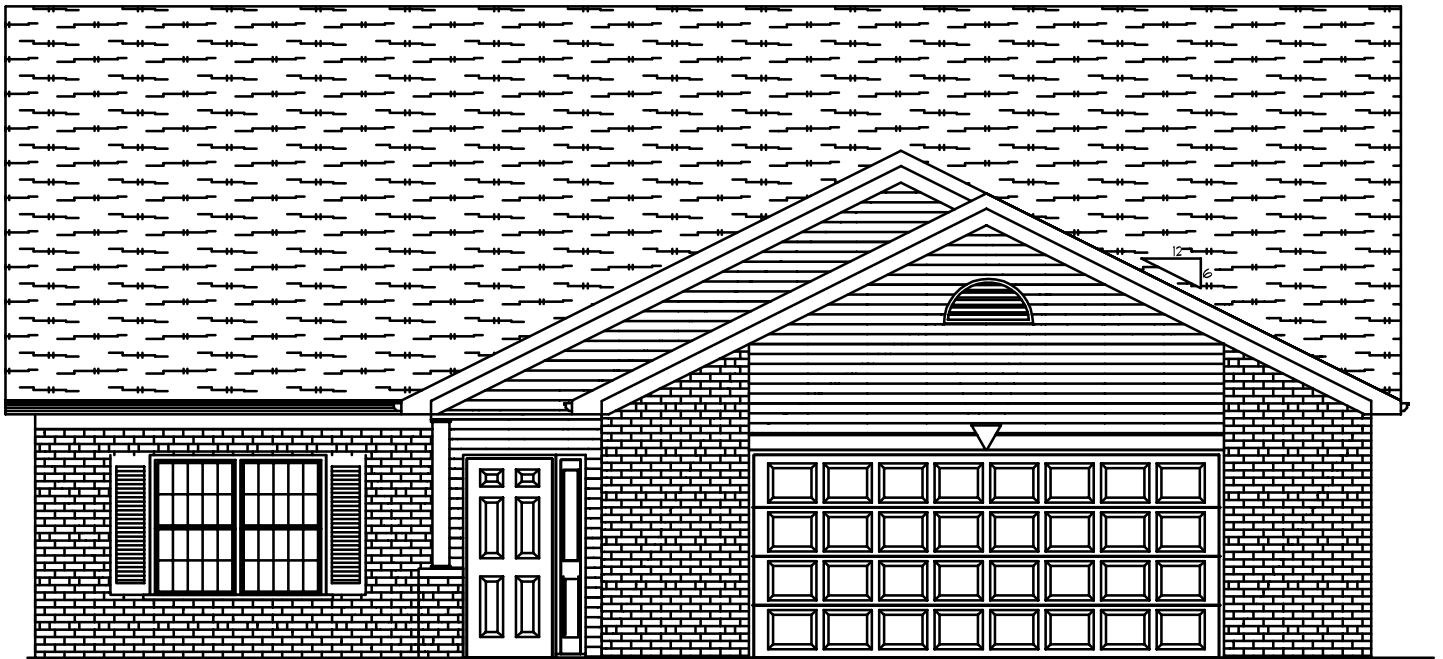
PINNACLE FRONT ELEVATION

THE GARDENS AT SOUTHSIDE ESTATES PINNACLE MODEL FLOORPLAN